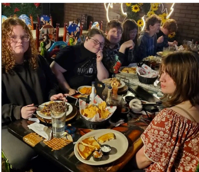
Students in Spanish class tried out their verbal skills at Jalapenos in Hill City!