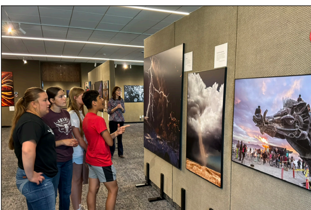
Logan High School freshmen look on in amazement at the photograph of lightning splintering across Iceland's erupting volcano, Eyjafjallajökull, during their visit to the Hansen Museum's SPECTACLE exhibition.

As summer begins, the Hansen Museum continues to offer visitors a variety of inspiring experiences through exhibitions, local artists, and engaging programs for all ages. There is still time to explore SPECTACLE, the extraordinary National Geographic exhibition that has sparked curiosity and conversation among visitors young and old alike, before it closes on June 14, 2026. The Hansen Museum is located at 110 W. Main Street in Logan, Kansas. Museum hours are Monday through Friday from 9:00 a.m. to 12:00 p.m. and 1:00 to 4:00 p.m.; Saturday from 9:00 a.m. to 12:00 p.m. and 1:00 to 5:00 p.m.; and Sunday and holidays from 1:00 to 5:00 p.m. The Museum is handicapped-accessible, and admission is always free courtesy of the Dane G. Hansen Foundation. For additional information, please call 785-689-4846. We hope to see YOU at the Museum soon!