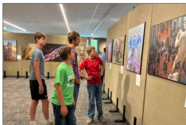
A group of Logan Junior High eighth-grade boys closely examine an up-close photograph of a damselfly's globular blue eyes during their visit to the Hansen Museum's SPECTACLE exhibition.

Send your stories, news & photos to thehillcitytimes@gmail.com