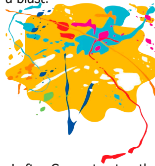
Left: Congrats to the $500 raisers for the color run fundraiser. They enjoyed a pizza lunch with a friend and a movie.