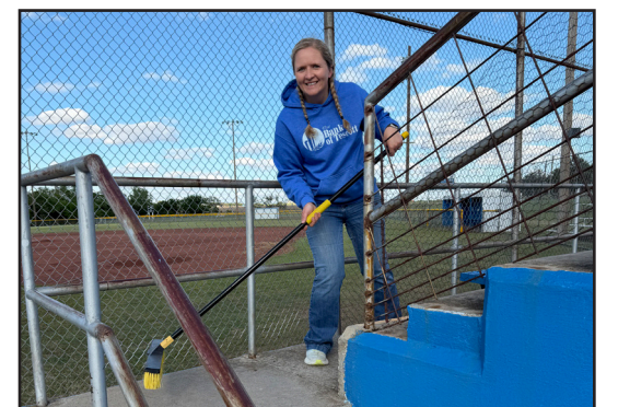
The Bank of Tescott employees partnered with the Lincoln Recreation Department for their Community Focus Project, helping clean and organize multiple areas of the facility, including the ballfields, concession stand, press box, and rec office.