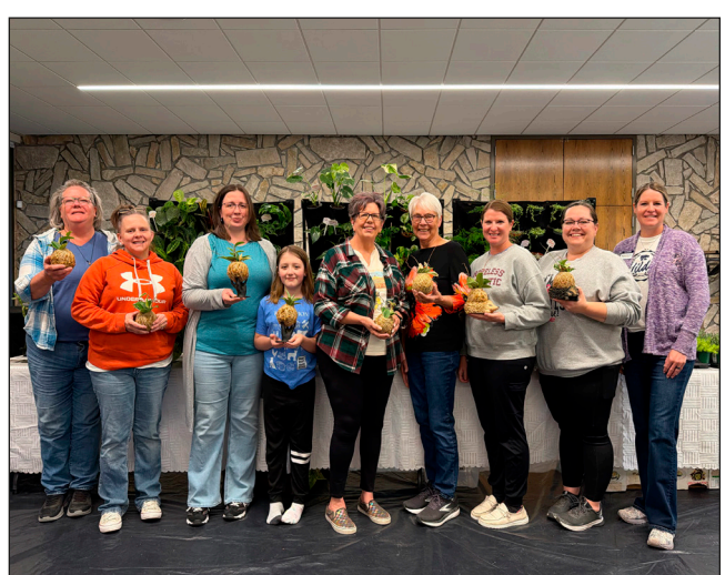
Participants in the Hansen Museum's Kokedama Class pose with their finished moss ball creations after an evening of hands-on learning and creativity.

The Museum is open Monday through Friday from 9 a.m. to 12 p.m. and 1 p.m. to 4 p.m.; Saturday from 9 a.m. to 12 p.m. and 1 p.m. to 5 p.m.; and Sunday and holidays from 1 p.m. to 5 p.m. The Museum is fully handicapped accessible, and admission is always free thanks to the generous support of the Dane G. Hansen Foundation. We look forward to seeing YOU at the Museum!