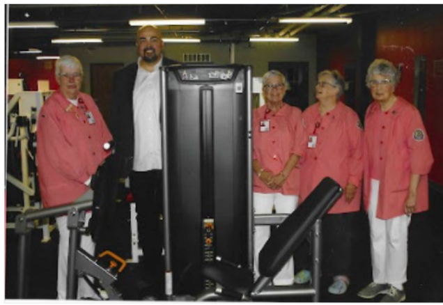
The Hospital Auxiliary got to see the new equipment they purchased for the wellness center at the hospital. They are very proud of the new equipment that the hospital has purchased. The new equipment is more up to date. These are some of the pictures of the new machines.