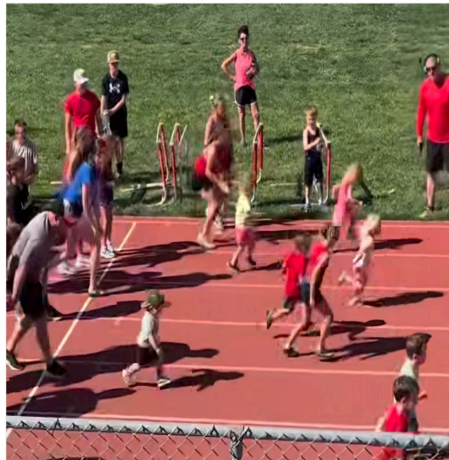
Left: hurdles Above: 50 yard fun run