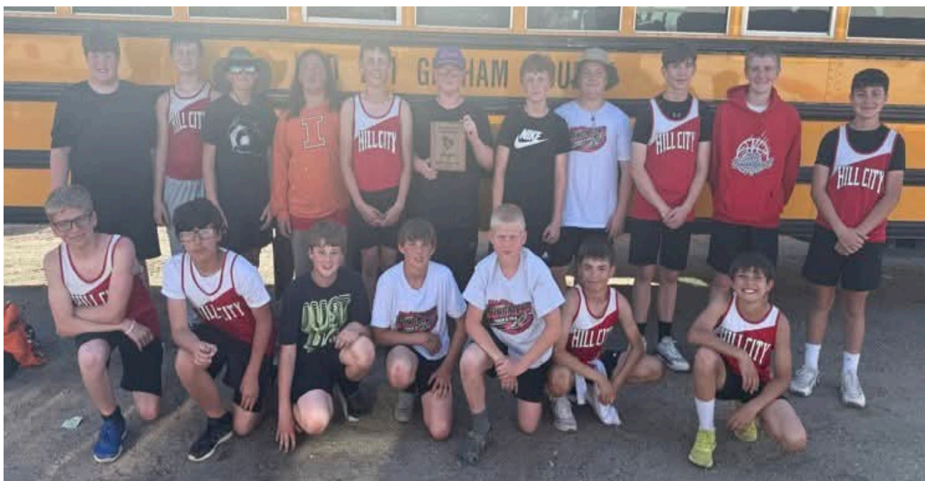
6th & 7th Boys Track team placed 1st at the Norton Invitational! Great start to the season Ringnecks!