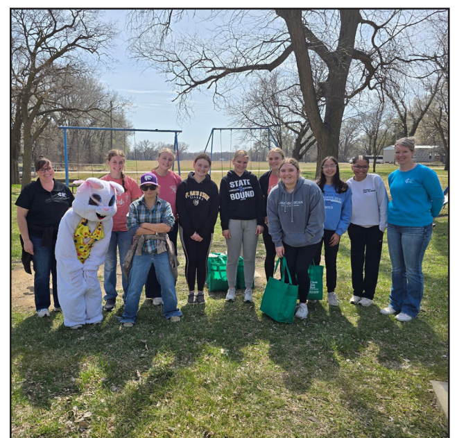
LJSHS KAY Club sponsored the first hunt of the season April 1 at Lincoln City Park.