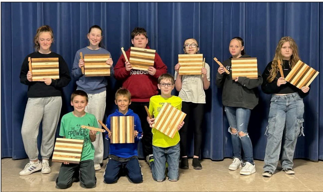
The 7th grade Industrial Arts students have completed their woodshop unit where they learned the proper and safe operation of woodworking machines. Using their newly acquired knowledge the students completed an oven push stick and a cutting board.