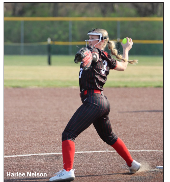
Sylvan-Lucas-Lincoln baseball split a doubleheader with Wichita Defenders, falling 8-6 in Game 1 before bouncing back with an 11-10 win in Game 2. The Sylvan-Lucas softball team dominated Pratt-Skyline, winning 17-1 and 16-2 in a doubleheader sweep.