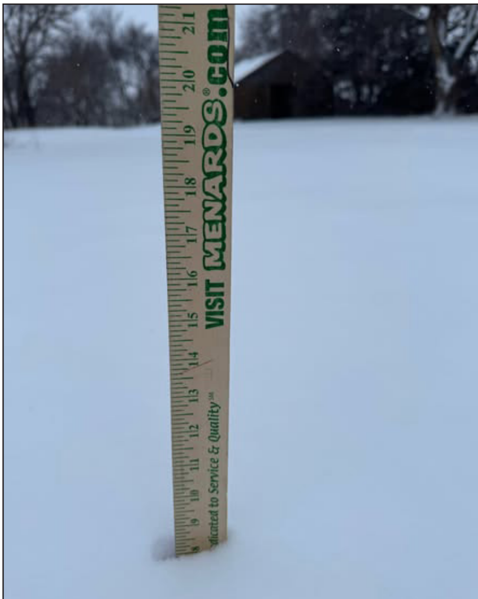
A yardstick in the snow measures the depth at the home of Cody and Ashley Wolting, nine miles south of Lincoln.

weather and bundle up before you go outdoors. Don't overdo it. You can help your neighbors and still be sensible about it. If you have