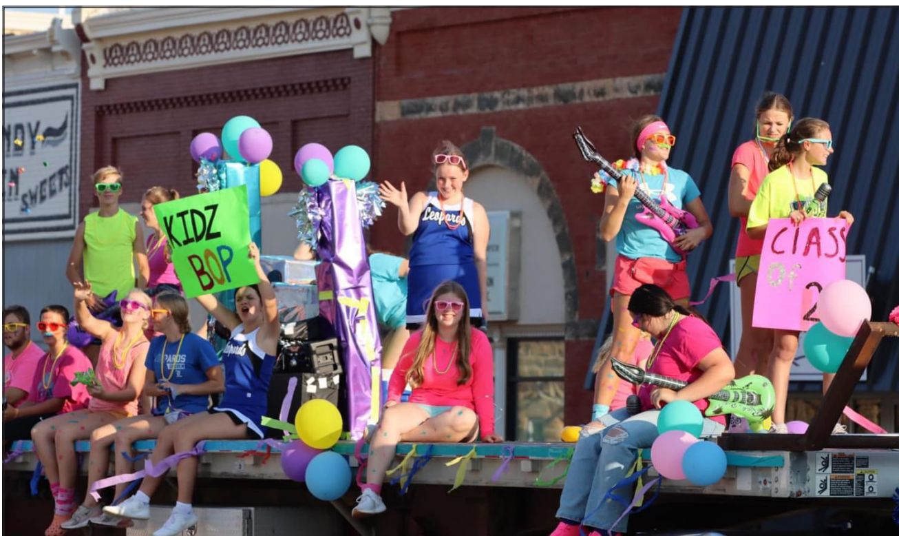
FRESHMAN CLASS FLOAT: "KIDZ BOP"