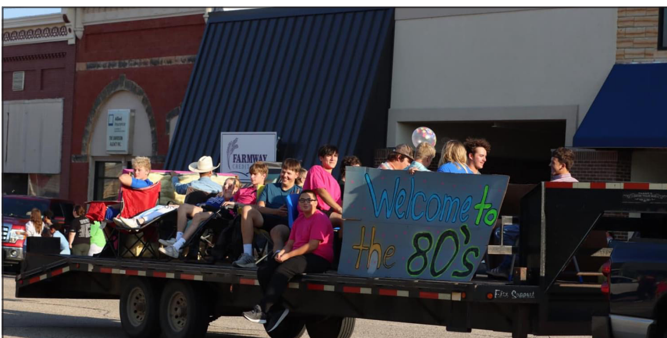
THE SENIOR CLASS FLOAT: "Welcome to the 80's"