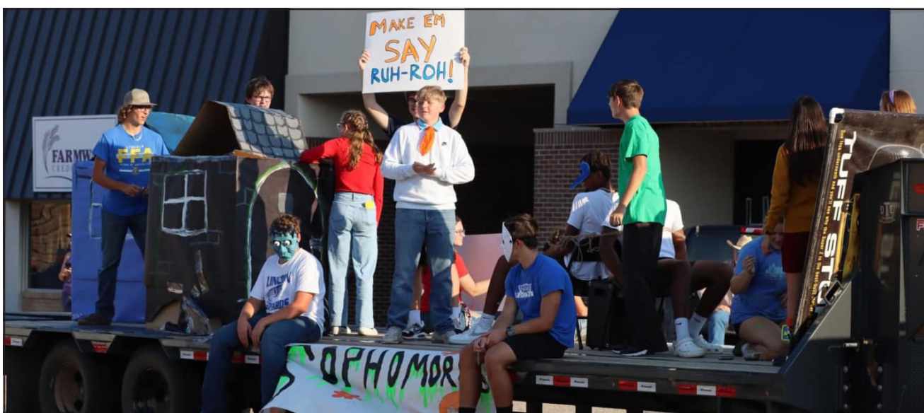
SOPHOMORE CLASS FLOAT: "Scooby Doo"