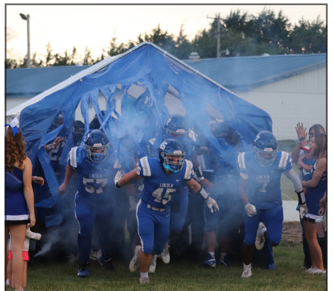
The Lincoln Leopards charge through their new tunnel, igniting the crowd with excitement as they take the field for another thrilling game under the Friday night lights.