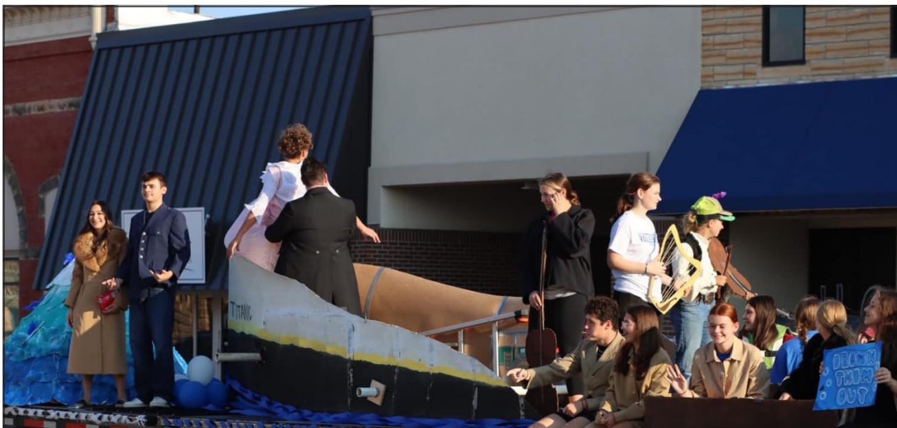
2024 WINNERS: JUNIOR CLASS FLOAT: "Titanic"